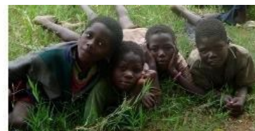
Chimwemwe Children's centre Blantyre, Malawi